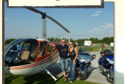
Terra Incognita 2015