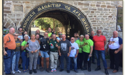
Terra Incognita 2017