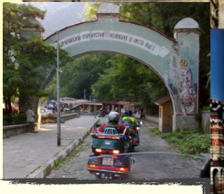
Terra Incognita 2016