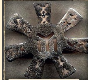
Medieval bulgarian sign