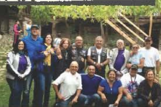
Terra Incognita 2014