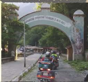
Terra Incognita 2016