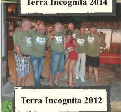
Terra Incognita 2012

GWCBG gladly invite you to join us for special edition of Terra Incognita tour of Bulgaria. It's will be held after 9th Bulgarian treffen from 12/15.09.2021. We will start from Balchik and will finish in Turkey. We are going to plunge into a country of hoodoo and ancient legends. We will visit one of the most famous Bulgarian monasteries, museums and archaeo-logical sites, antique Thracian temples and tombs. We will close the days, relaxing in best hotels with delicious Bulgarian cuisine and the best wines from the region. To enjoy the best, we are offering an All Inclusive trip. Participation fee covers two nights in Bulgaria and one night in Turkey in 4* hotels, breakfast, lunch, dinner, coffee breaks, museum, galleries, a unique T-shirts, certificate and personal gift. Each day Terra Incognita will end in a different town with a special dinner of local food and drinks.