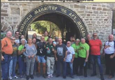
Terra Incognita 2017