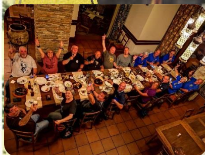
Terra Incognita 2018